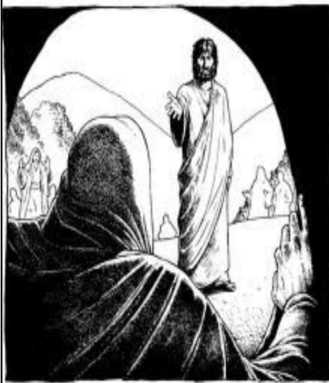
Lazarus John 11:1-45